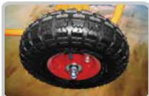
• Improved design of enlarged tires to eliminate bumpy road